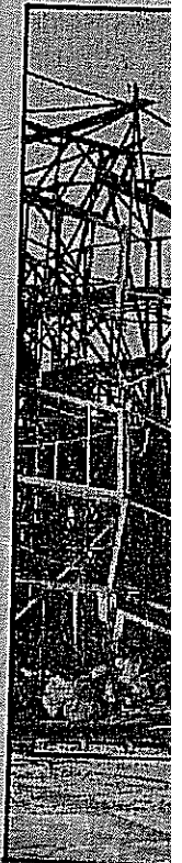
In 1965, fire destroyed an amusement ride structure.